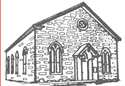
“The Little Church with a Big Heart!”